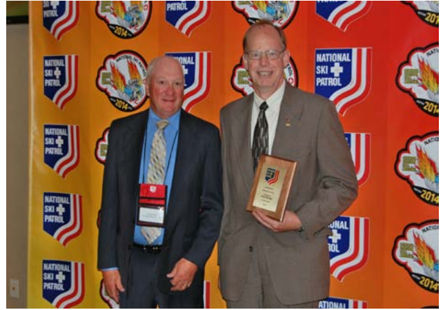
Harold Park - Skills Development Perfect North Slopes Ohio Region