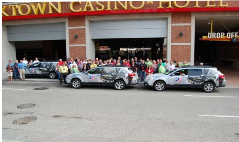
Central Division Board and staff pose with Subaru Outbacks provided to the NSP through the major sponsorship commitment of Subaru. Thank you Subaru!. Support and recommend all our sponsors.